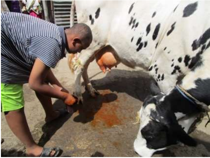
Training on herbal medicine