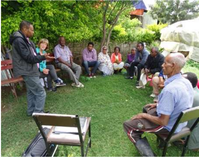
Participatory analysis and monitoring of cattle health situation