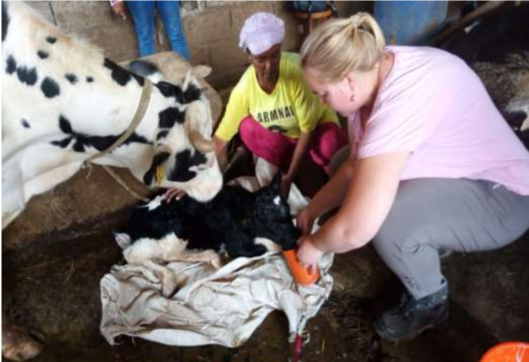
Training on improved calf care and hoof trimming