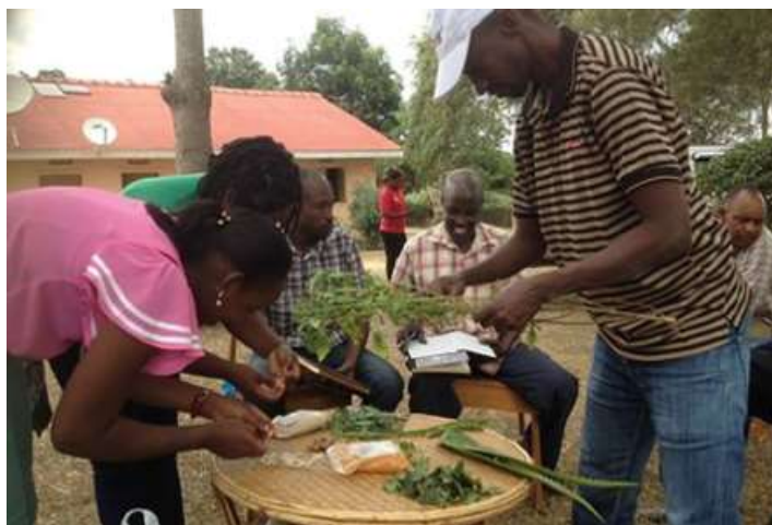
Uganda: Next webinar on herbal tick control