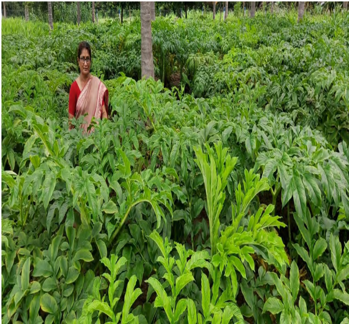
Organic yam cultivation