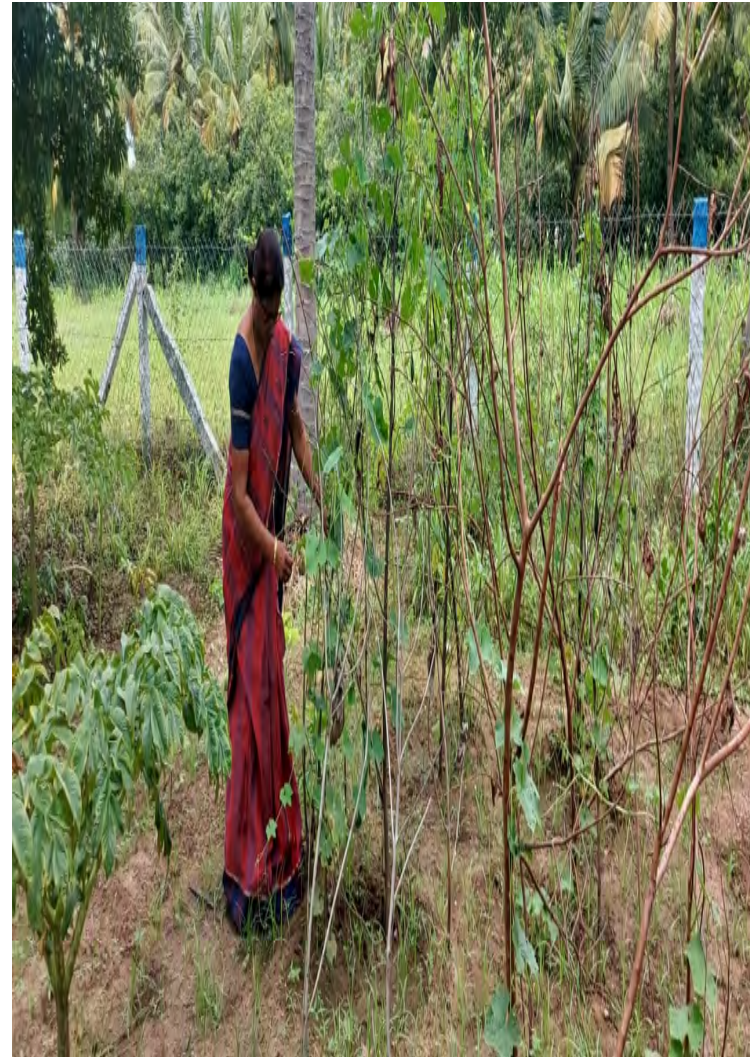
Organic Bitter guards