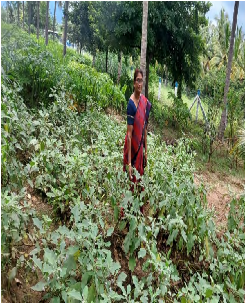
Egg plant – organic Brinjals