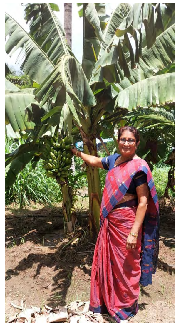
Plaintain - banana